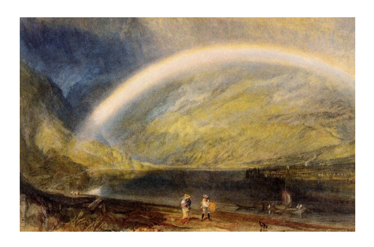
J. M. W. Turner, 'The Rainbow'