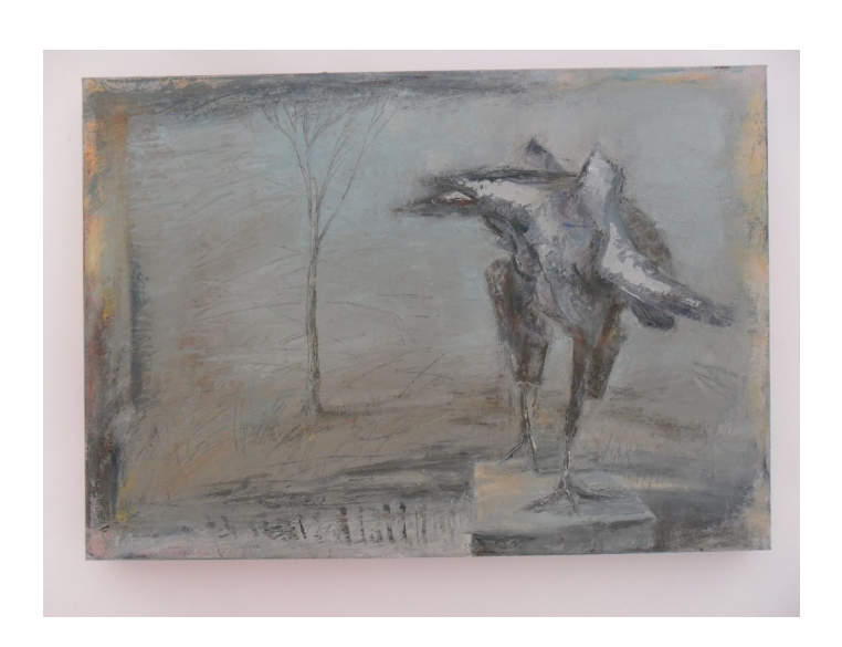
'Raptor' by Anthea Richards; currently on display as part of the 'Hatched 2018' exhibition