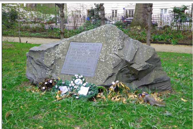
Tavistock Square monument to conscientious objectors. "TO ALL THOSE WHO HAVE ESTABLISHED AND ARE MAINTAINING THE RIGHT TO REFUSE TO KILL. Their foresight and courage give us hope."

Please send newsletter contributions well in advance of the intended publication date.