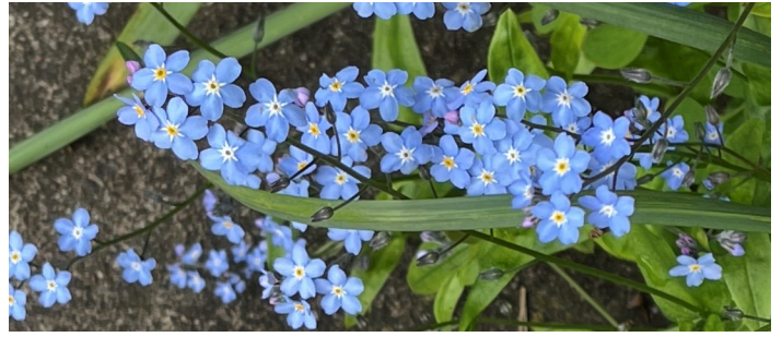
Forget-me-nots in the garden at 43

Colombian pacifists and peace activists are actively and creatively saying 'no' to war today, and they – like the Israeli peace activists – are inspiring voices. As one of the Colombian activists, Santiago Forero, remarked, 'Every person in this country needs a mechanism to say no to war.' Here in the UK, I believe we should use all the mechanisms we have to hand to say the same thing - 'No to War!'