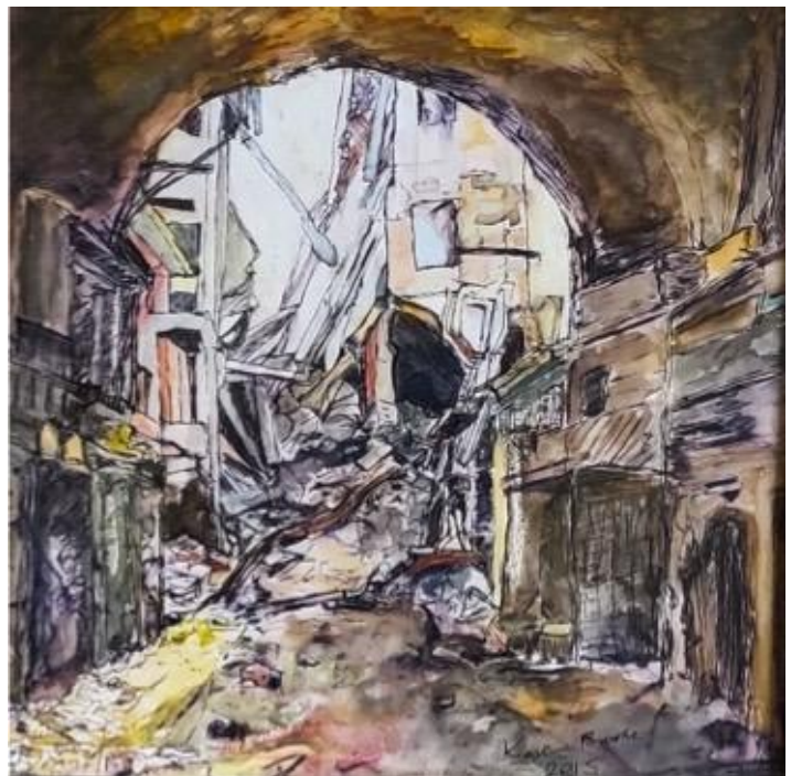
By Karima Brooke

Crik, crak, crik, crak now where's the flak jacket? what we report is re-enacted as sport ricocheted retort that grenade fell short down by the port meant for police convoy of super-power envoy hit schoolboy and girls - a decoy? inevitability, repeatability what we narrate is born of hate.