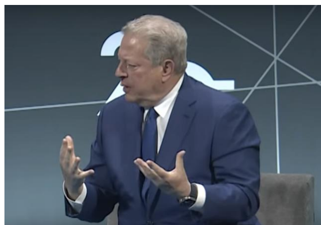
Al Gore at the Skoll World Forum, 2023, from their Website.

Why walk when you can dance? Why talk when you can sing? Why rush on by when you can connect? Dare I add, why minister verbally when so much can be celebrated by silence?