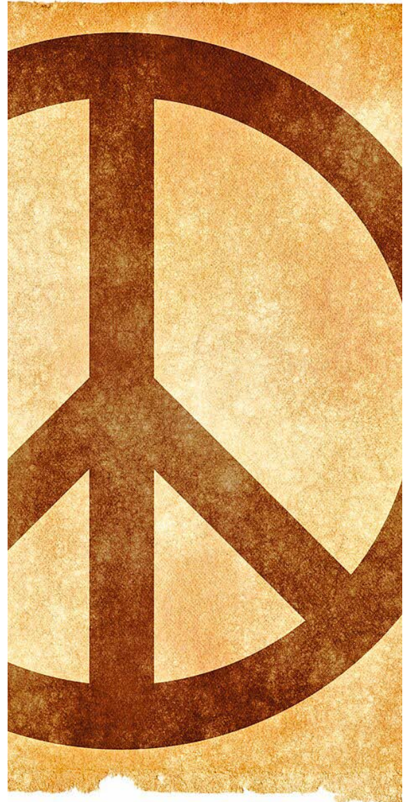
Original image from Wikimedia . Modified by M. Hughey

Peace Pilgrimage Podcast | Podcast on Spotify