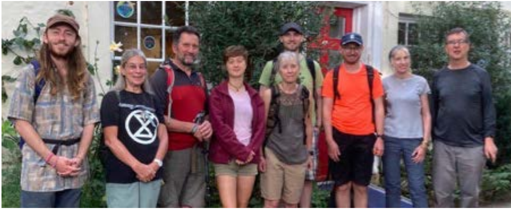
Witnessing against the arms trade and the DSEI arms fair.

Over the week, we were blessed with scorching sun (which at times was a little too hot for our liking!), and for the first few days we all soaked in the beauty of the English countryside. As we walked, we talked, sharing stories, jokes, reflections and more. Each day there was a wonderful blend of deep and serious conversations and much humour and laughter, darkness, and light, which kept us flowing ever onwards.