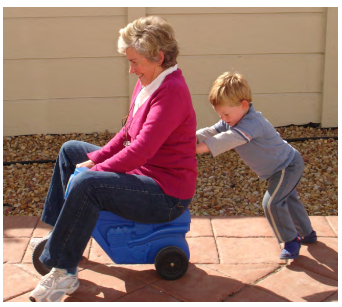
Child pushing grandmother on plastic tricycle, Wikimedia Commons. <u>Creative Commons Attribution-Share Alike 2.0 Generic</u>